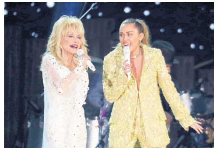
Dolly Parton, left, and Miley Cyrus perform "Jolene" at the 61st annual Grammy Awards in Los Angeles on Feb. 10, 2019.

pressing LGBTQ support meant for students. "These confusing messages about rainbows are ultimately creating a culture that seems unsafe towards queer people," she said. □